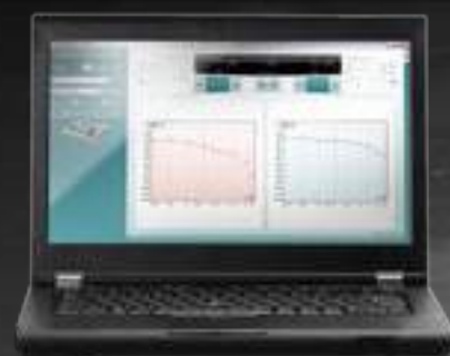
Diagnostic Suite software (AS608e only)