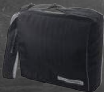
The soft carrying case

The AS608 / AS608e will operate with 3 standard AA batteries or a medically approved external power supply. Typical battery life is six months.