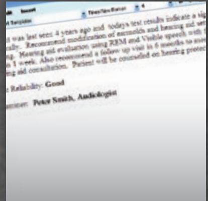
Report page from the Diagnostic Suite (AS608e only)