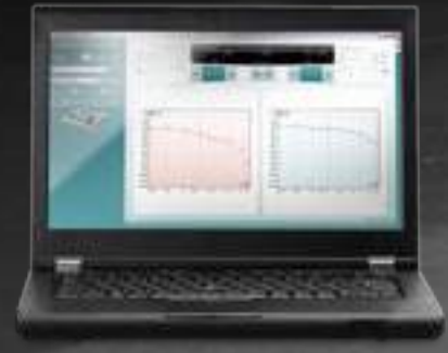
Diagnostic Suite software (AS608e only)

The AS608 / AS608e will operate with 3 standard AA batteries or a medically approved external power supply. Typical battery life is six months.