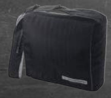
The soft carrying case

The AS608e includes the Hughson Westlake automatic pure tone test procedure. When the test is completed the results are easily recalled from the internal memory of the AS608e and displayed in the Diagnostic Suite PC software.